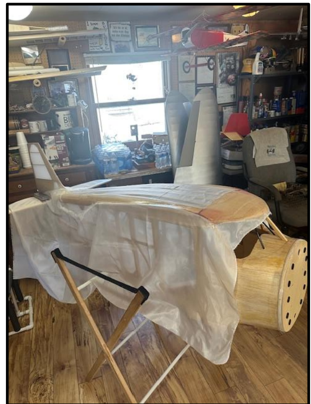
Covering the Stinson